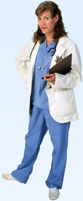
Assigned Biological Sex